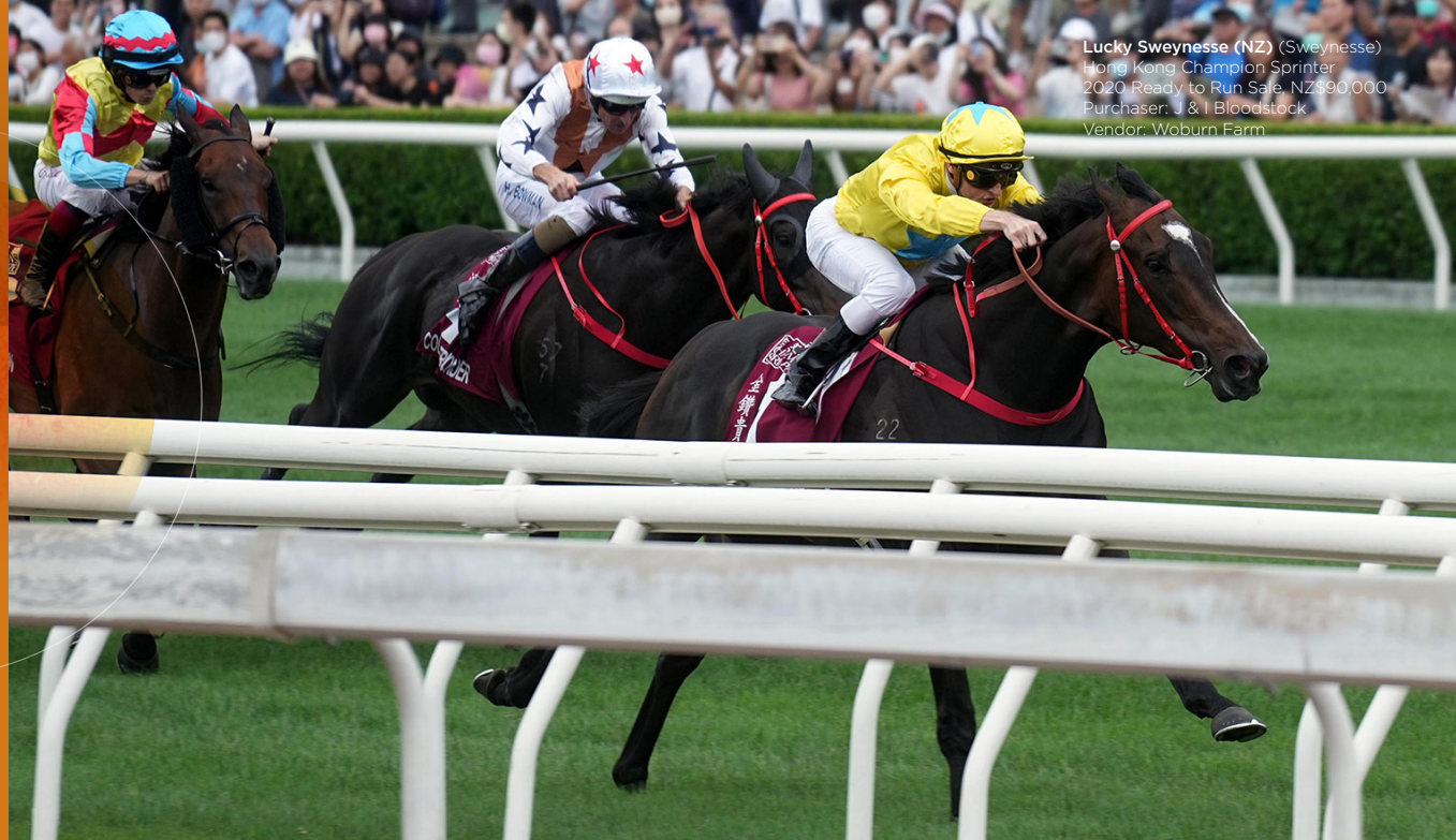
Lucky Sweynesse (NZ) (Sweynesse) Hong Kong Champion Sprinter 2020 Ready to Run Sale, NZ$90,000 Purchaser: J & I Bloodstock Vendor: Woburn Farm