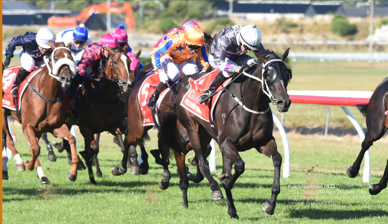
Pulchritudinous (NZ) (Wrote) 2024 Group One New Zealand Oaks 2022 Ready to Run Sale, Res $50,000 Vendor: Riverrock Farm