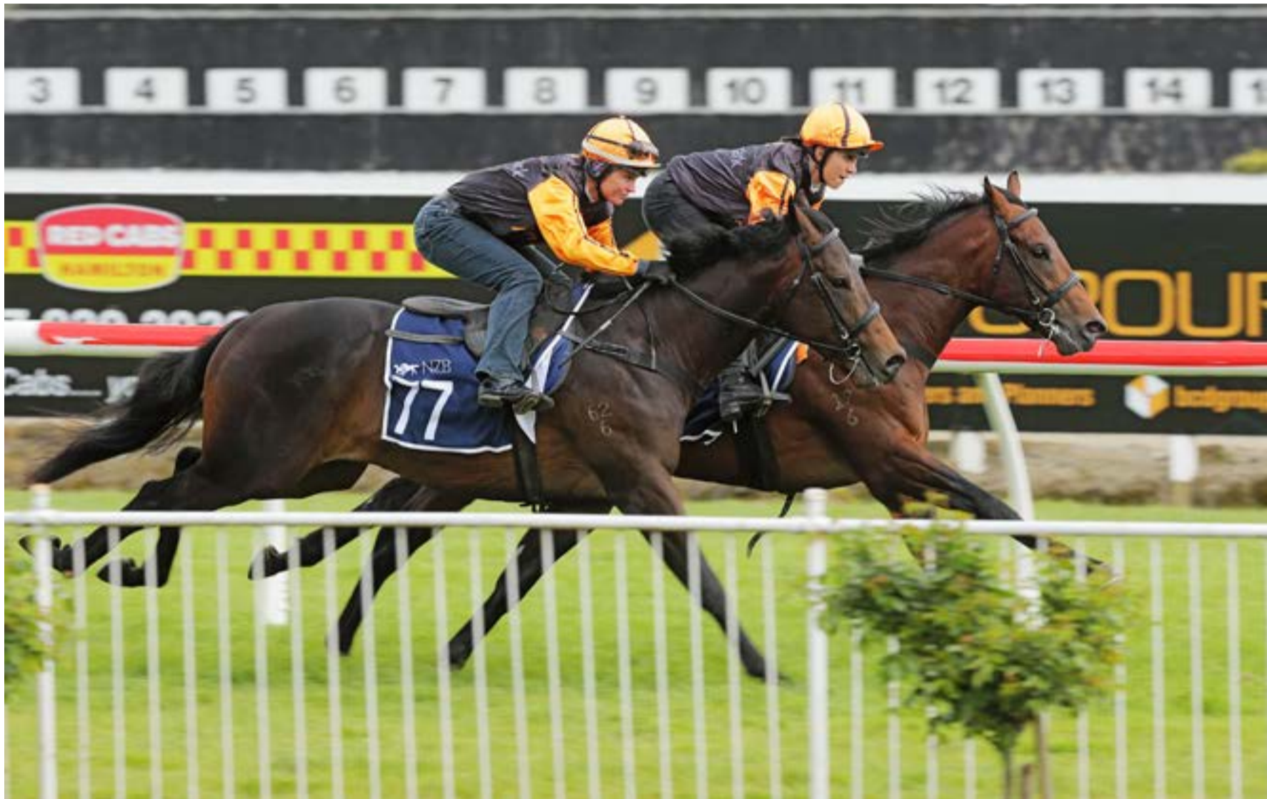
Prima Park Lots 77 and 67, by Charm Spirit and Holy Roman Emperor, breeze-up stylishly.

In a short time Prima Park has built a high profile on the thoroughbred sales landscape, and that will be enhanced by another quality draft going forward to the 2018 Ready to Run Sale.