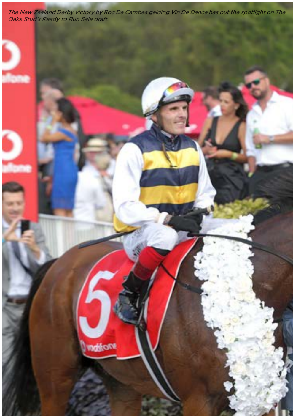
The New Zealand Derby victory by Roc De Cambes gelding Vin De Dance has put the spotlight on The Oaks Stud's Ready to Run Sale draft.

Completing The Oaks Stud's Ready to Run draft is Lot 355, a colt by Redwood out of Anna Kaye, who is a half-sister to the Gr. 1 ARC Railway Stakes winner Fleur De Lune.