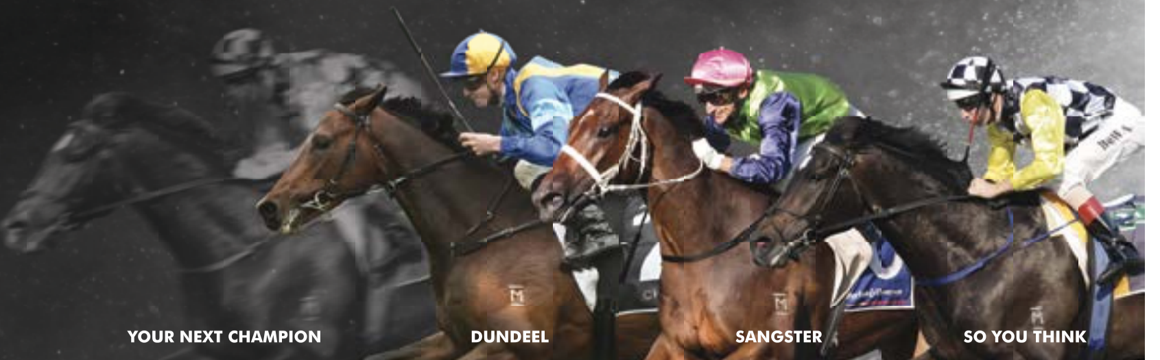
YOUR NEXT CHAMPION