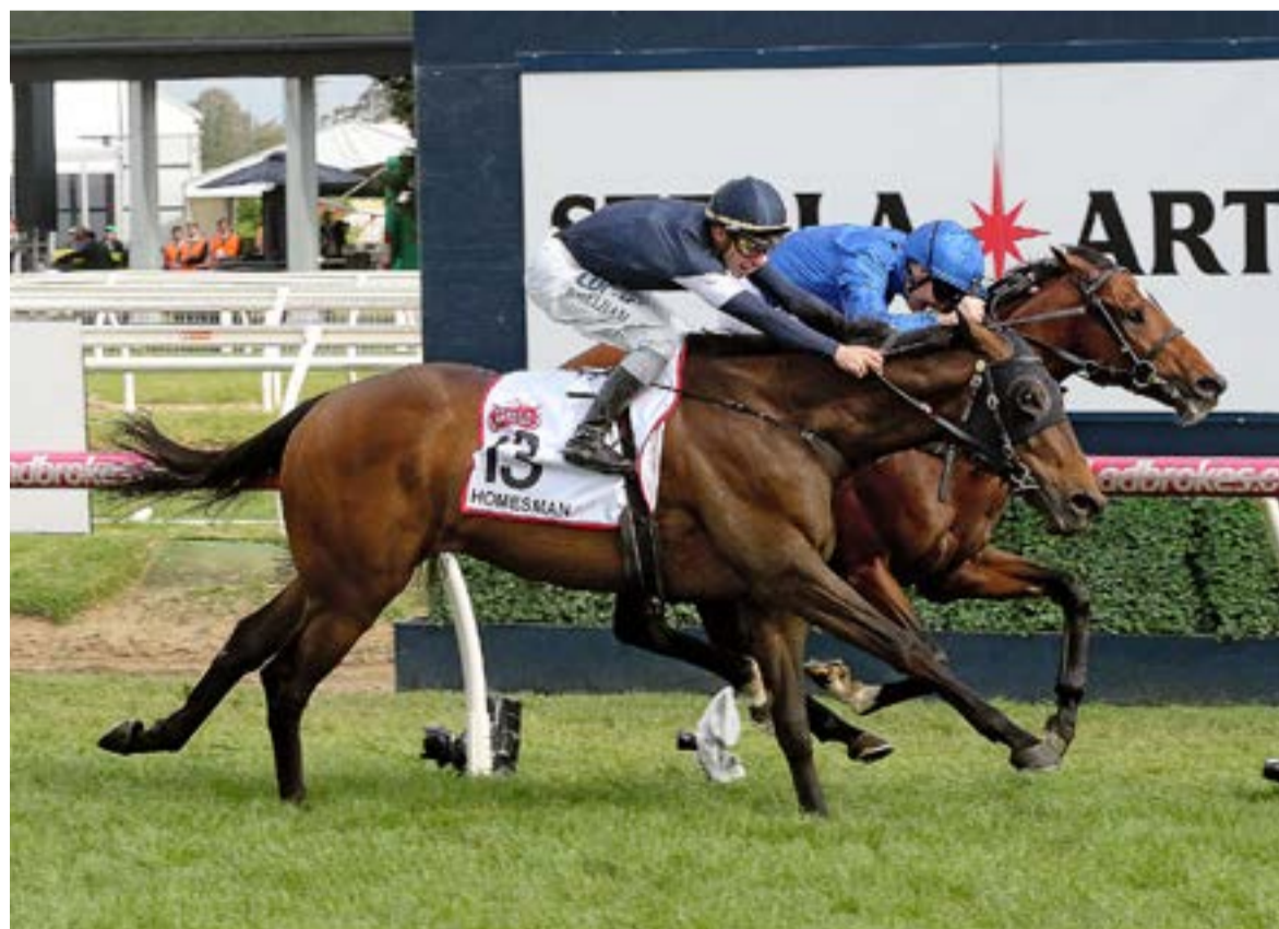
The Caulfield Cup win by Best Solution puts the spotlight on his close relation, Anzac Lodge's Deep Field colt, Ready to Run Sale Lot 223.

Lot 333 is out of a sibling to Bobby Dazzler, who won the Listed Wanganui Guineas in September.