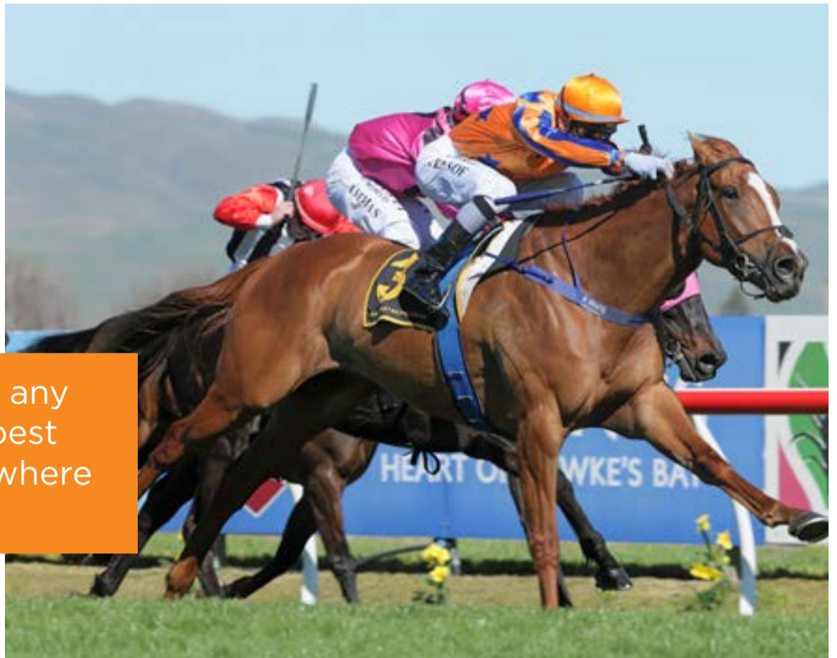
Ready to Run Sale graduate Te Akau Shark is one of New Zealand's most exciting young galloper.