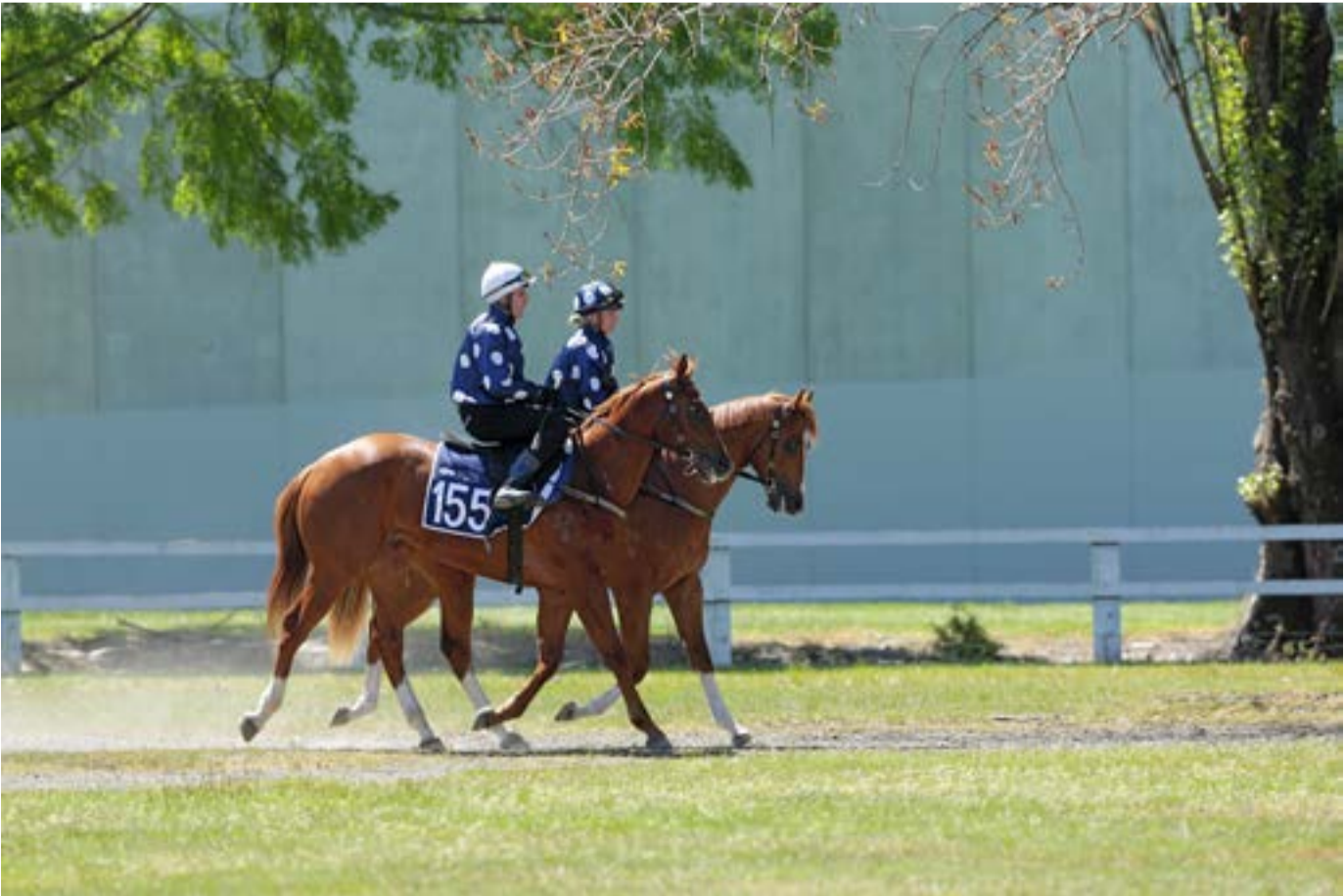
Right: A showy pair from Riversley Park.