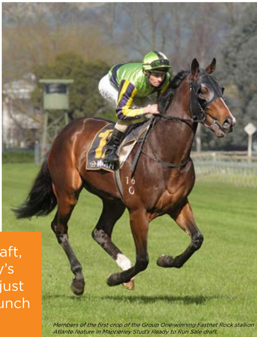
Members of the first crop of the Group One-winning Fastnet Rock stallion Atlante feature in Mapperley Stud's Ready to Run Sale draft.