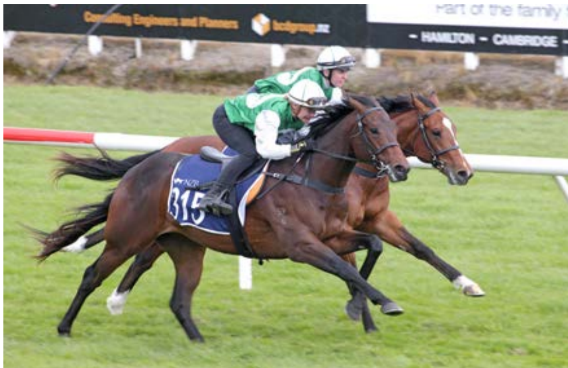
Kilgravin Lots 315 and 366, colts by Dissident and Written Tycoon, hit out boldly at the Ready to Run breeze-ups.

Stallions represented in the Kilgravin offering include local champion Savabeel and his former Waikato Stud associate Pins, Tavistock, Pentire, Showcasing, Makfi, Darci Brahma and Per Incanto, along with leading Australian sires Exceed And Excel and Written Tycoon and younger brigade members Shamexpress, Ocean Park, Dissident, Wandjina, Proisir, Sacred Falls, El Roca and Rubick.