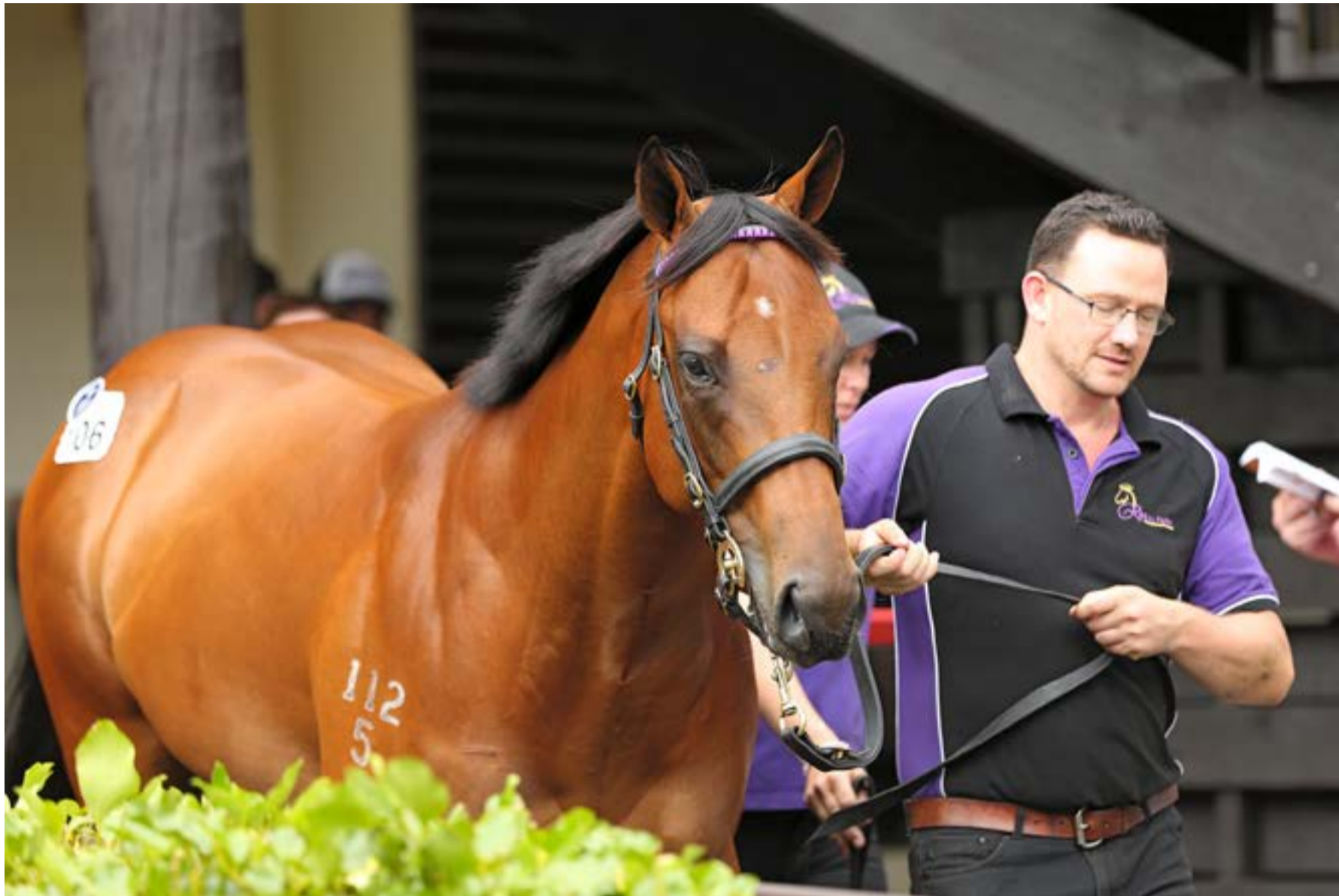
Regal Farm's Hinchinbrook-El Ashb colt topped the 2017 Ready to Run Sale at $430,000.

After producing the sale-topping lot at two of the last five editions of the Ready to Run Sale at Karaka, Cambridge's Regal Farm is hoping for more of the same in 2018.