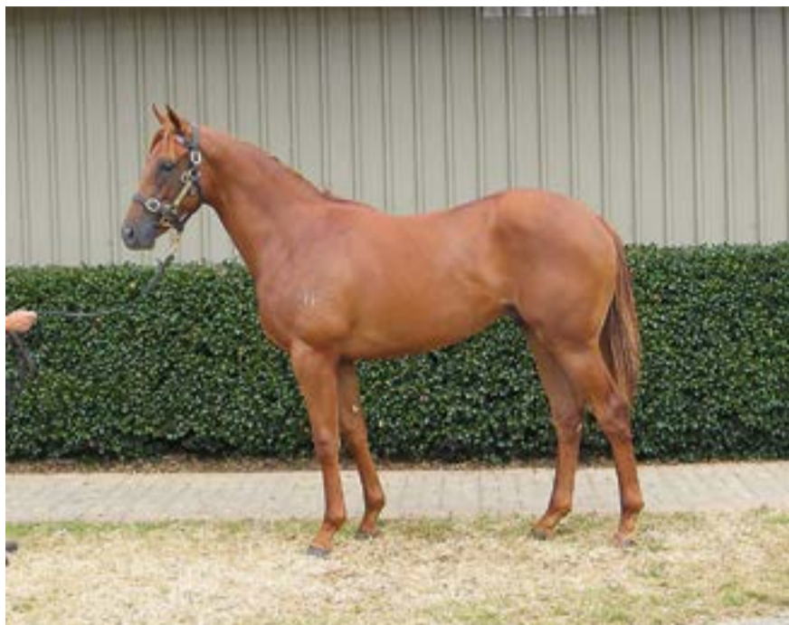
Ohukia Lodge's Iffraaj-Just A Dream colt will be pinhooked as Lot 70 at the Ready to Run Sale after being purchased for $50,000 at the National Yearling Sale.