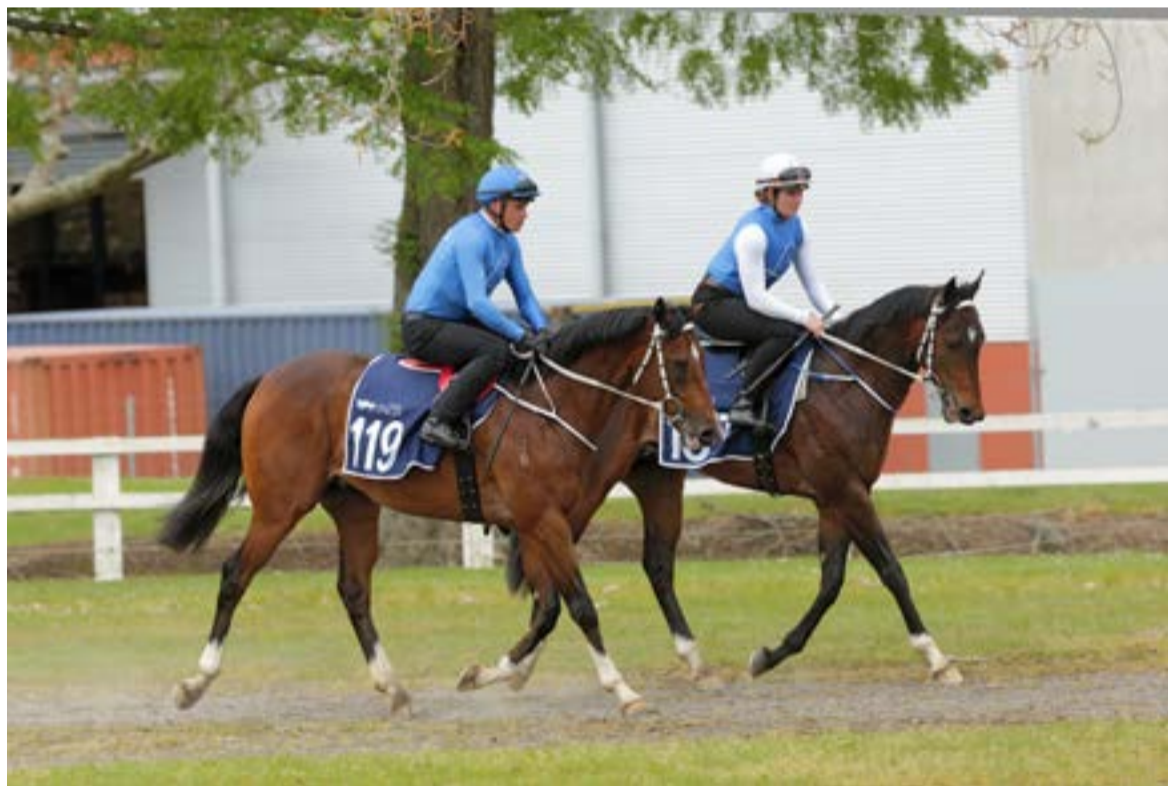
Lyndhurst Farm Lots 119 (Zacinto) and 157 (Spirit Of Boom) pictured at the breeze-ups.