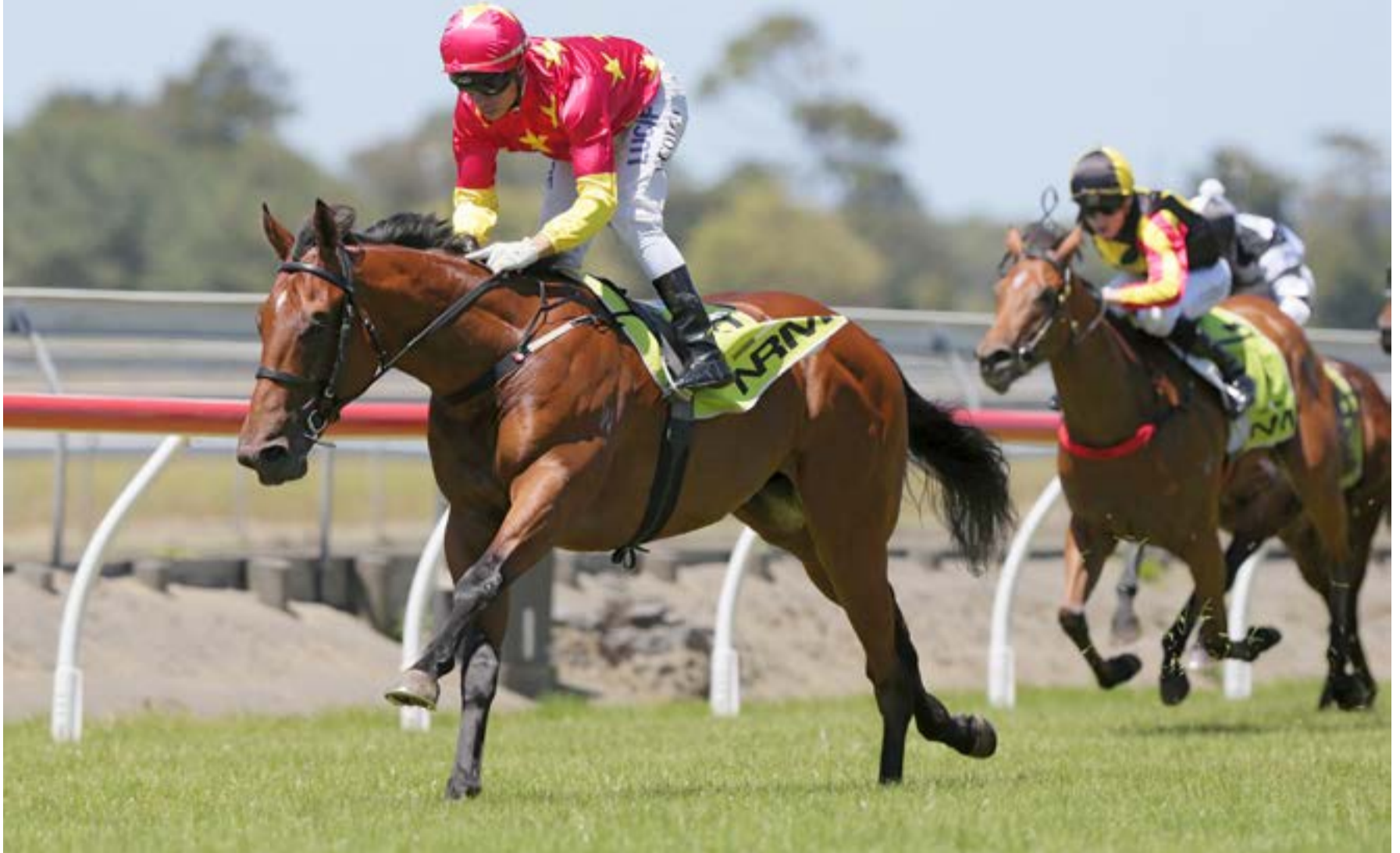
Talented galloper Aim Smart is a Ready to Run Sale graduate from Wellfield Stud.

Palmerston North's Wellfield Lodge is a growing player at the Ready to Run Sale and will head to Karaka next month with a quality draft.