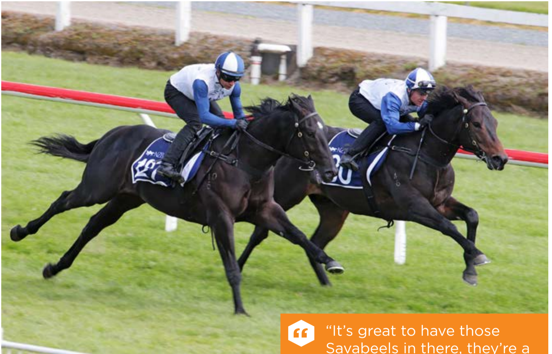
Ohukia Lodge's pair of Savabeel colts, Lots 127 and 180, breeze up in slick time.