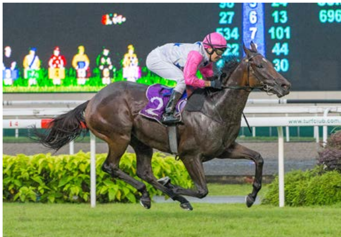
Dual Derby and Caulfield Cup winner Mongolian Khan is one of many headline graduates from the Karaka Ready to Run Sale.

Proven record combines with sire power and expert preparation